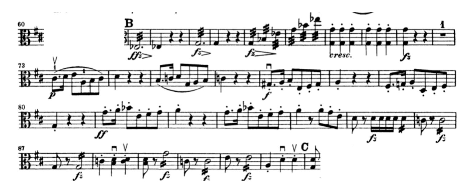
3. Fauré: Requiem , I. Introit et Kyrie QN = 90, 4/4 time

2. Schubert: Symphony No. 8, "Unfinished" I. Allegro Moderato QN = 104, 3/4 time